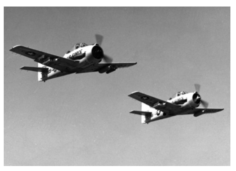
T-28s armed with machine guns, bombs, and rocket launchers.

Saw combat in Asia, Africa, North America, South America ★ designed to transition pilots from prop to jet aircraft, the first to do so ★ given call sign Zorro by 606th ACS in Thailand ★ sold to French Air Force, which modified them and used them in Algerian War ★ used by 23 air forces ★ nicknamed Nomad, Fennec ("desert fox"), and Nomair ★ known as Tora-Toras in the Philippines ★ supplied by CIA in 1960s to Moise Tshombe's regime in Congo.